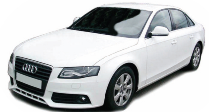
Sapphire Car Program

Help five team members get to Jade and reach Sapphire ($1561/month average income + a Kyäni car!)